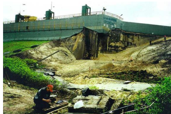
Fig. 1- Failure of Dychow dam (Poland)

Internal erosion is a complex phenomenon which represents one of the main sources of risk to the safety of earthen hydraulic structures such as embankment dams, dikes and levees. Its occurrence may cause instability and rupture of these structures with consequences that can be dramatic (Figure 1).